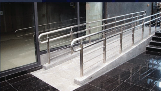
PWD-friendly access at the ground floor