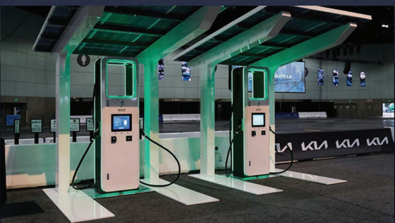
Electric Vehicle (EV) Charging Station at basement 1