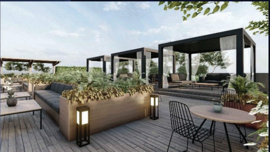
Landscaped roof deck with al fresco dining areas