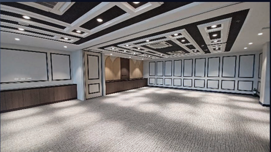
Events space and function rooms at the 14th floor